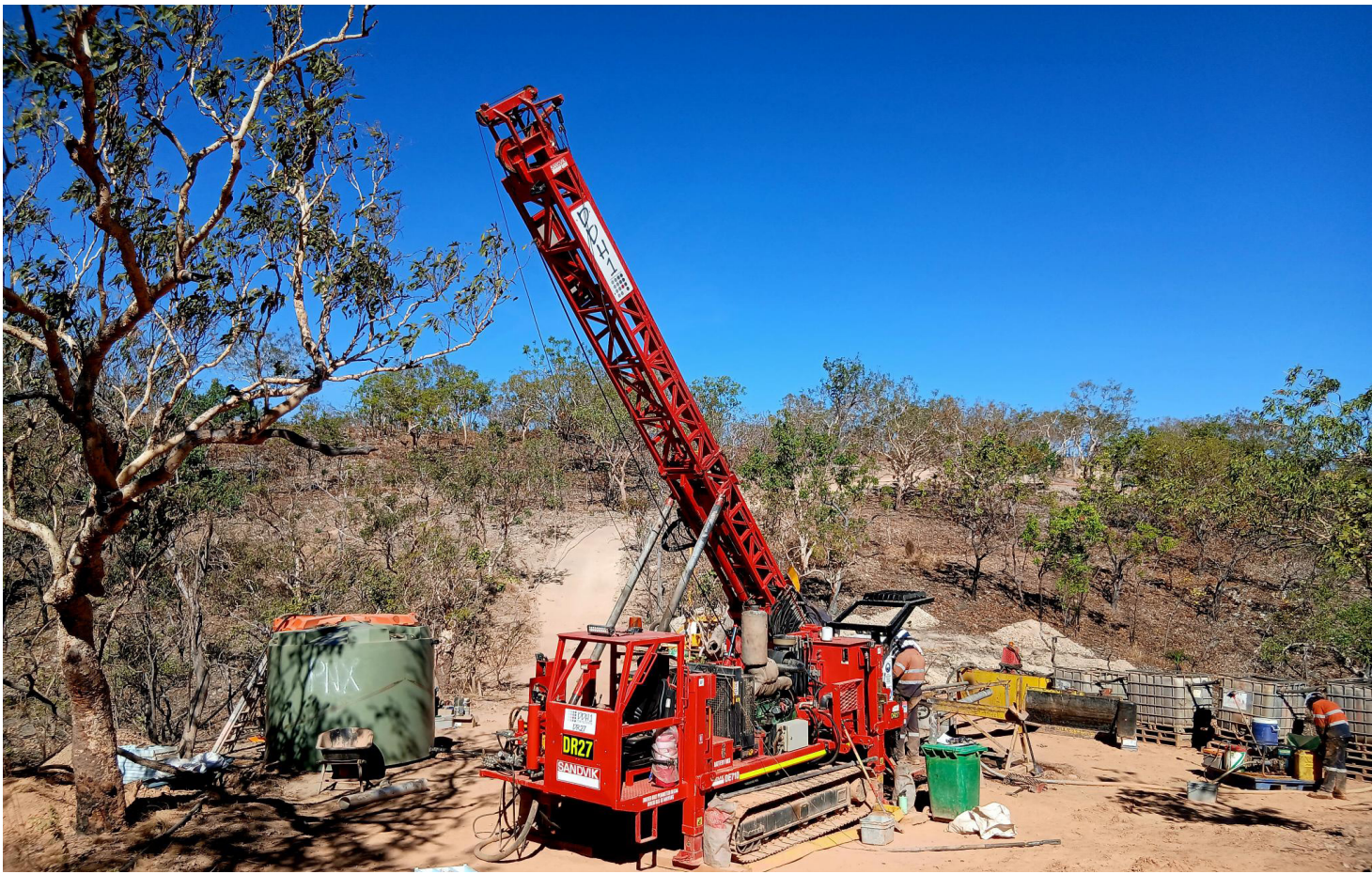
Drilling in Pine Creek, courtesy of Patronus Resources Ltd